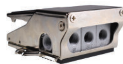
F FOOT PEDAL